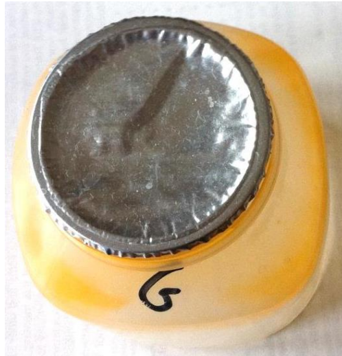
Fig. 1. Aluminum foil used for sealing jars shows imperfection around the sealed circumference.