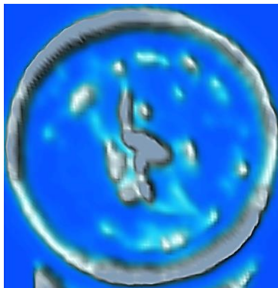
Fig. 4. A terahertz surface image of a sample showing details surface morphology. Defective and non-defective regions are clearly visible.